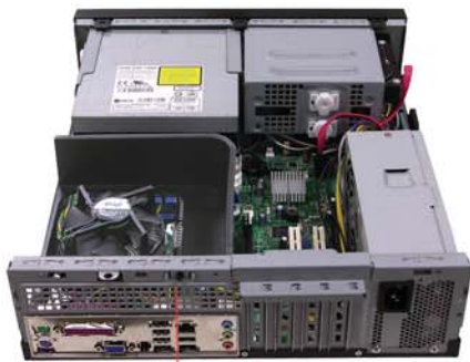
Intrusion switch (optional)