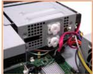
Screwless HDD,ODD FDD assembly (standard devices)