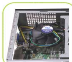
57mm KOZ Illustration

chassis build in Intel DQ45EK with Intel boxed Core 2 Duo Processor (TDP 65W)