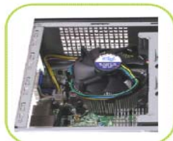
57mm KOZ Illustration

chassis build in Intel DQ45EK with Intel boxed Core 2 Duo Processor (TDP 65W)