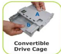
Convertible Drive Cage

Allowing to assembly a standard 5.25" Optical Drive or a 3.5"HDD