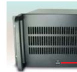
With Aluminum alloy handles, D shape aluminum handles is by order request