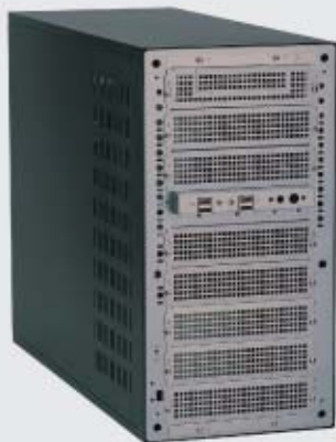
Type A: 8*5.25" drive bays+2xHDD Bracket