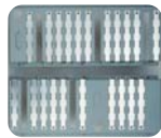
Accepts extended motherboard or 8-14 slots passive backplane