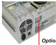
Optional 6cm fan for hot air exhaust out