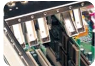
Patented adjustable Card hold-down clamp protecting plug-in cards against vibration