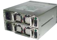
ATX Power supply 300W~600W or Mini redundant 300W~400W