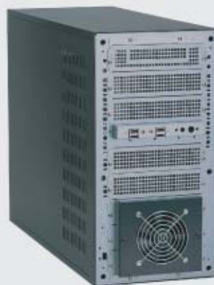
Type B: 5*5.25"+7*3.5"HDD drive bays

HDD frame for 5-devices HDD, with anti-vibration soft mounting kits and 9cm cooling fan